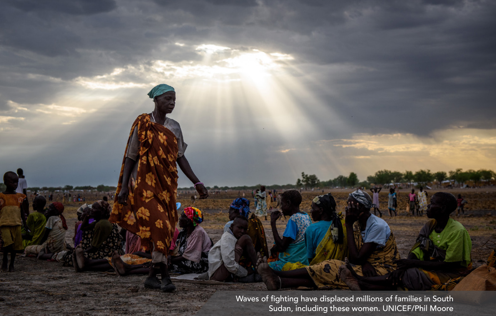
Waves of fighting have displaced millions of families in South Sudan, including these women.

crises, committing Member States to address conflict prevention at a ministerial level.